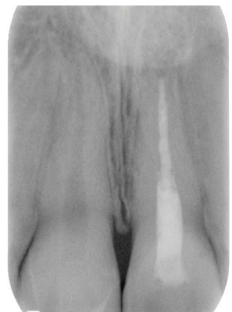
Figures 27-28: Radiographs, before and after