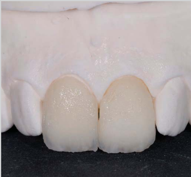
Figure 33: Frontal view of bisque bake 1