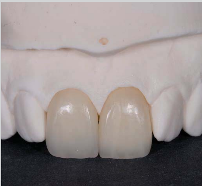
Figure 35: Frontal view of bisque bake 2