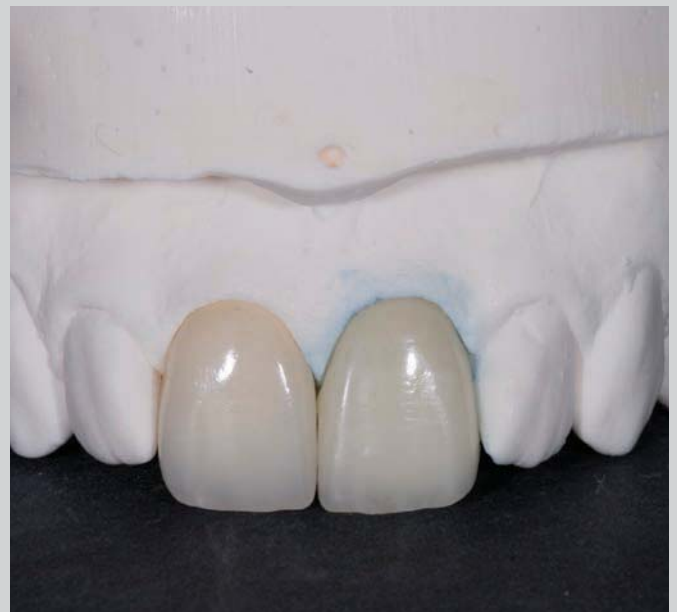
Figure 36: View of completed case on model

a blue opalescent enamel, was used on the incisal corners. The whole surface was then covered in a thin layer of T11. Mesial and distal edges were built out slightly to allow precise modification of contacts. A second firing cycle was then carried out with a slight temperature reduction to limit any further shrinkage of the previous layer. This two-stage build up technique allows greater control of shrinkage and modification of any internal effects before the final enamel layer is applied, thus avoiding a complete restart of the ceramics should the internal effects need intensifying or reducing.