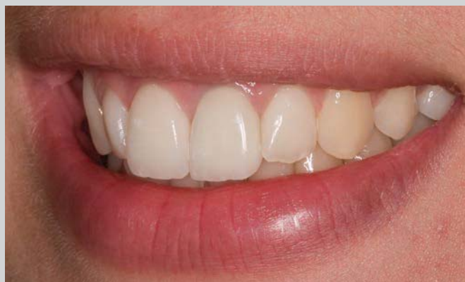
Figures 9-10: Smile views, left, before and after