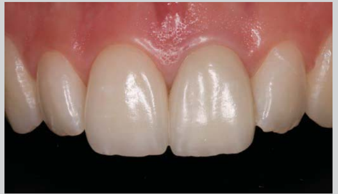
Figures 17-18: Views, anterior, before and after