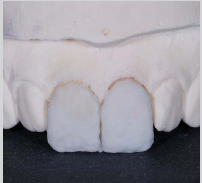
Figure 34: Frontal view of build-up 2