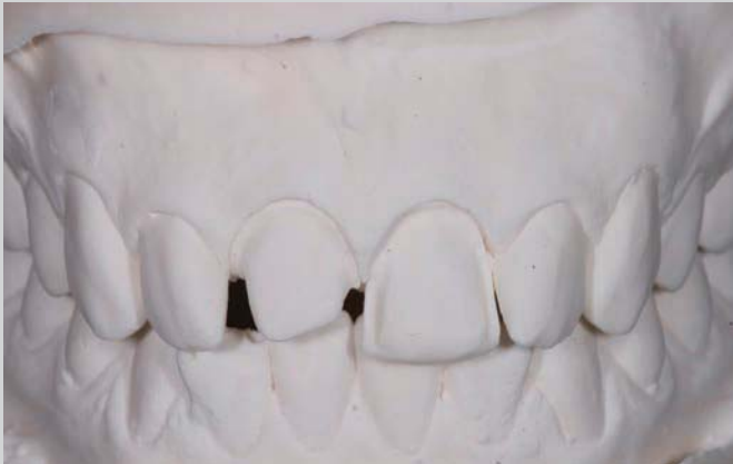
Figure 29: Frontal view of models articulated