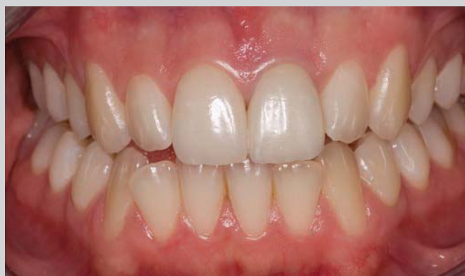
Figures 11-12: Retracted views, anterior, before and after