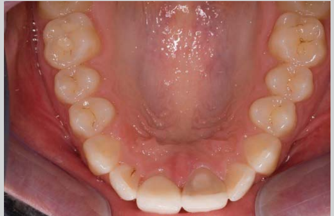
Figures 23-24: Upper occlusal views, before and after