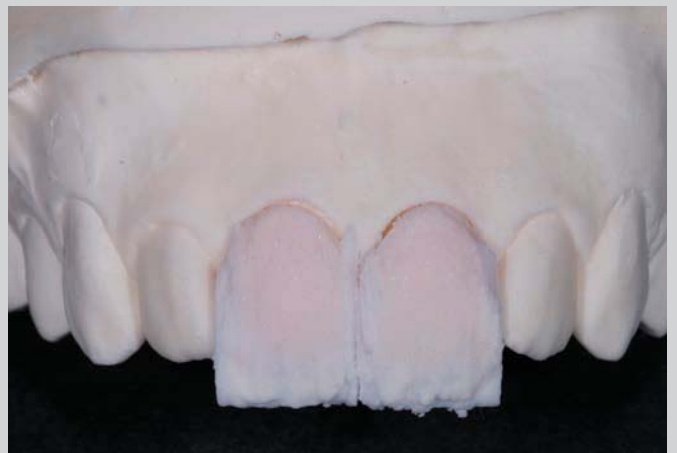
Figure 32: Frontal view of build-up 1

to approximately 80% of the size of the provisional restorations. These were then milled from an Emax MO1 block via the MCXL milling unit. After approximately 10 minutes the completed frames were removed from the milling chamber and the fit was checked on dies with blue marker under magnification.