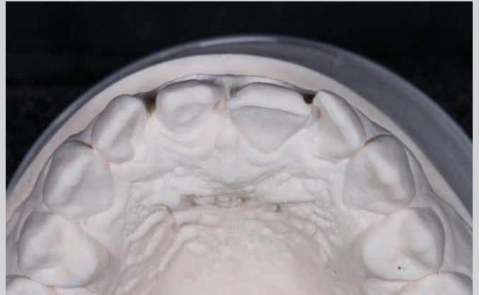
Figure 30: Occlusal view of model