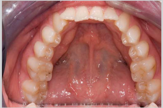
Figures 25-26: Lower occlusal views, before and after

removal of the working dies. An additional solid cast was also made using Fujirock EP, which would be used for verification of contacts and tissue contour.