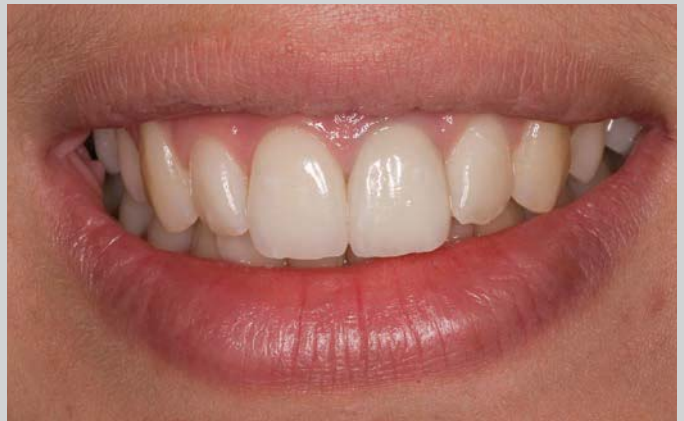
Figures 5-6: Smile views, anterior, before and after