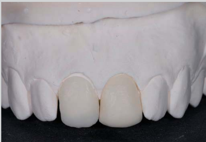
Figure 31: Frontal view of framework